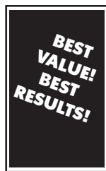
Full Page 4 3/4" X 7 3/4"