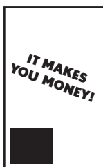
1/8 Page 2 1/4" x 1 3/4"