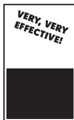
1/2 Page 4 3/4" X 3 3/4"